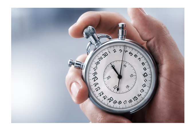
Decentralized distributed measurements with imc CRONOS flex : flexible, synchronous and secure

Furthermore, imc STUDIO makes it simple to perform test sequences automatically. An integrated sequencer allows the individual measurement and evaluation steps to be combined into one test sequence. Procedures such as loading the configuration, starting measurement, evaluating data and creating a report are simple to define as it is to create multiple page user guidelines. This renders repetitive manual tasks obsolete and shortens the path to finding a solution to any problem.