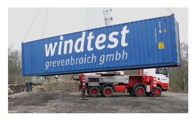
LVRT container, picture: © Windtest Grevenbroich GmbH

For this real-life measurements and other measurement approaches can be performed using low voltage ride through (LVRT) test containers.