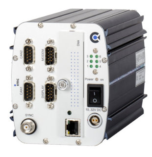
imc C-SERIES: multi-functional measurement system

imc offers a number of solutions that meet the specific requirements of condition monitoring. These solutions include autarkic measurement systems that are capable of performing complex signal processing wihout even needing a PC. Furthermore, important characteristic values can be extracted and transferred via modern communication networks to a central monitoring station. imc solutions offer security by making possible the comprehensive and continuous monitoring of an installation. The advantages are savings in expenses associated with travel to an installation and a reduction in the overall amount of work required.