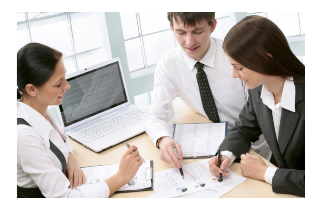
imc offers users a second series of products which have been especially designed for less dynamic measurements and for the acquisition of data in extreme temperatures – imc CANSAS.

This ensures a complete overview of the current state of the wind energy installation and its individual components. Furthermore, because the results of an analysis are available continuously at all times, it is possible to intervene directly in the test whenever a need arises.