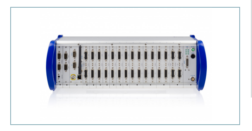
FIGURE 8. imc CRONOScompact DAQ system

imc Online FAMOS, thanks to DSPs, integrated into the data acquisition equipment, permits the real-time processing of analysis and result data from acquired channels without using a PC. More than 150 elementary functions are available to be combined arbitrarily, in order to implement sophisticated and customized evaluation algorithms. It is possible to perform synchronized mathematical calculations on hundreds of "live" data channels originating from the acquisition.