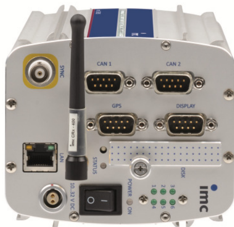
Compact & versatile: imc C-SERIES measurement system

The imc C-SERIES is equipped with differential and isolated universal measurement amplifiers with analog anti-aliasing filters. The universal measurement amplifiers offer a high degree of dynamics, precision, low-noise and flexibility. They are suitable for the direct connection of: